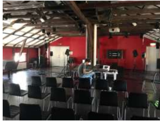
Concert Hall at MAM and Black-box Hall (experimental electroacoustic music)

The international orientation of the study programme benefits also from the extensive contact network the MAM has developed with renowned universities and music colleges, mainly in the Nordic area and Europe. The existing and very active international student exchange program at MAM enables the students to study abroad for a part of a study programme and to gain enriching new experiences and perspectives, as well as to welcome incoming students and visiting lecturers from various countries. The internationalisation process at MAM is a very important concern of its management, reflected in the Strategic Plan 2017-2021 and the Action Plan 2017-2021, where specific and pragmatical activities and terms to achieve the goals are proposed.